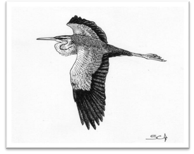
Purple Heron