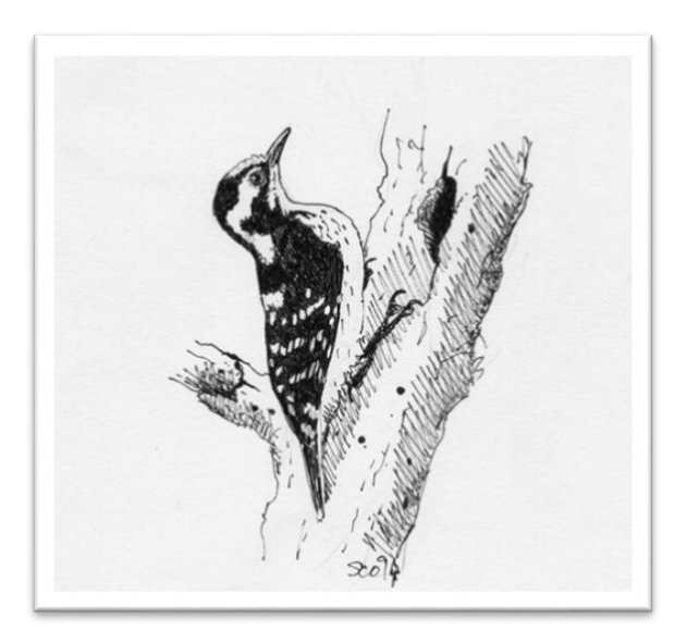
Lesser Spotted Woodpecker

Recorded every month. Mainly single birds but several pairs seen with 3 at Swanton Morley on 4<sup>th</sup> Jan (DA), Sparham Pools on 8<sup>th</sup> Feb & 27<sup>th</sup> July (JP), Kerdiston on 26<sup>th</sup> Feb (JP), Felthorpe on 26<sup>th</sup> Jan (MAS), Elsing Mill on 21<sup>st</sup> June (A&CJ), Dereham on 7<sup>th</sup> June (IB), Hoe Bird Walk on 16<sup>th</sup> Aug (DK), North Tuddenham on 20<sup>th</sup> July (B&BP). Up to 4 were reported at Attlebridge in Feb & June (WO) and Hoe Bird Walk on 15<sup>th</sup> Mar (DK). Pensthorpe proof of breeding 1ad+1juv 9<sup>th</sup> June.