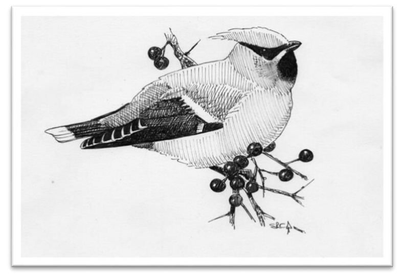
Waxwing