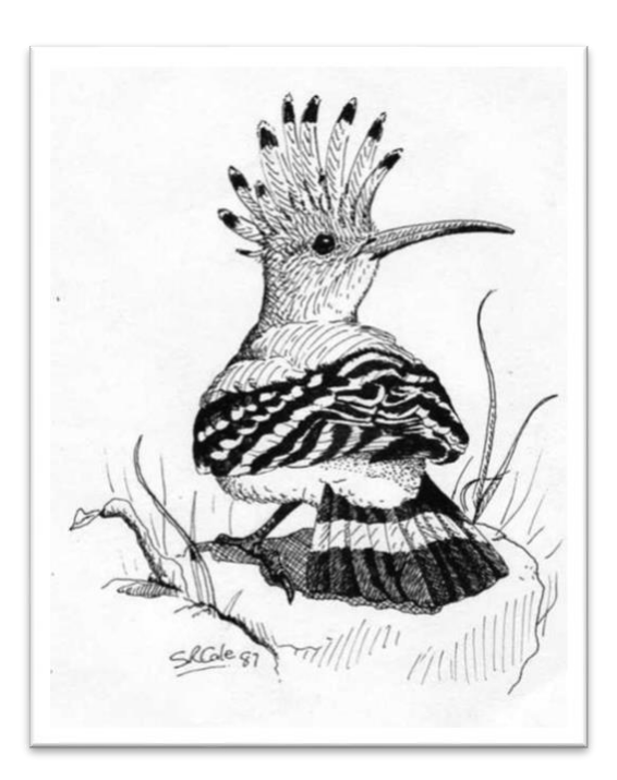
Hoopoe