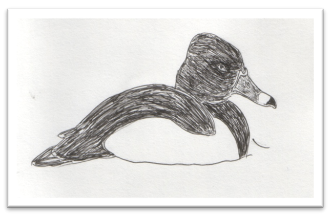
Ring-necked Duck